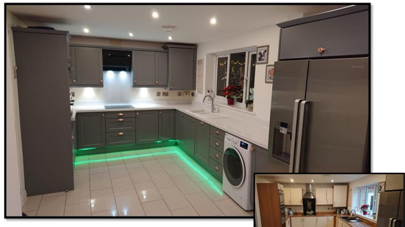
Door/Drawer fronts have been replaced and MiniQ overlay worktop installed.

Here are some before and after pictures of kitchens we have revived